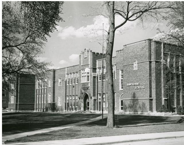
Hawthorne School, 1966. M2012.1.44