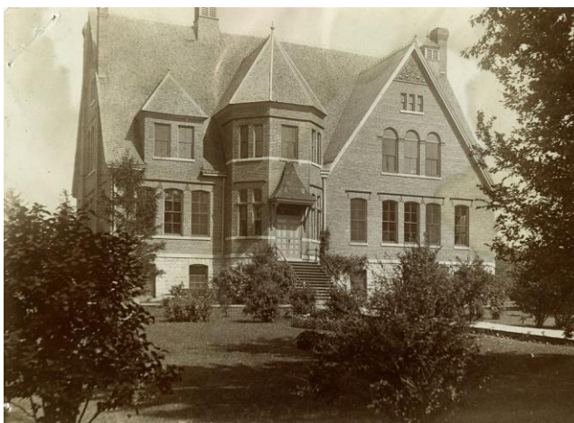
Elmhurst Public School, circa 1900. P73.1.4

The Elmhurst Public School name was changed to Hawthorne School in 1910 when the school board was planning a second school (Eugene Field) for the district.