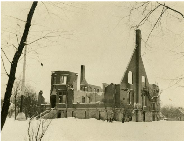
Hawthorne School following a fire, 1917. M2012.1.43

It was not an automatic decision to rebuild Hawthorne on the same site. In fact, the school board was unanimous in its decision to build the replacement school close to the intersection of Kenmore and Adelia – stating that it was closer to the center of the student population. A Protest Committee formed and there were many meetings, studies, petitions and articles in the newspaper. A second issue that complicated matters was what to do about the high school – keep it with the elementary school, build a separate high school in a new location, or make it a