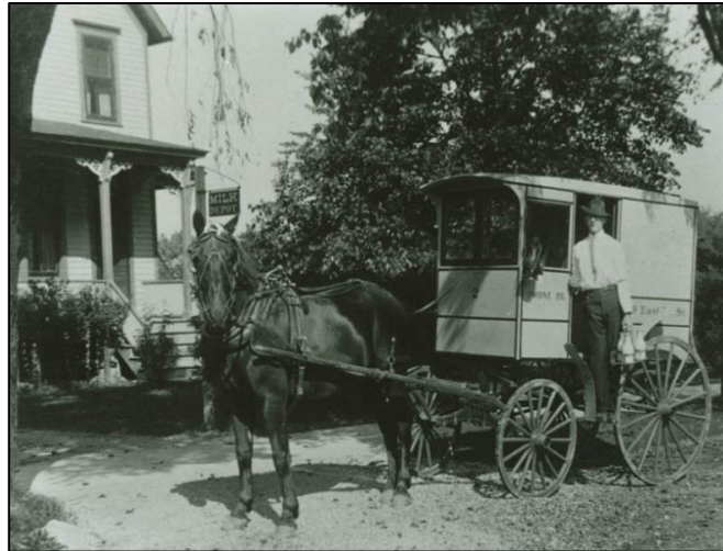
Rabe's Dairy delivery wagon, 1914 M2011_12_32